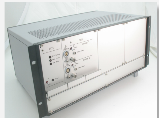
Fig2: Switching amplifier SA75D