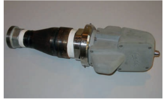
Fig. 1: WT 230L sound emitter.*

The article below describes one such innovation to address the emerging need for tracing and identifying the water pipelines, which can be polyethylene or metallic, underground or above the ground surface. WATER TRACKER is a Piezo electric actuator based product and result of strong technical co-operation between 2 French SME companies, MADE S.A. (www.made-sa.com) and CEDRAT TECHNOLOGIES S.A.