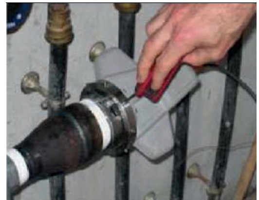
Fig. 2: WT 230L sound emitter connected to a pipeline under test.*

WATER TRACKER is a system designed and developed for TRACKING and IDENTIFYING polyethylene water pipes using a technique based on propagation of complex acoustic waves. The same equipment also allows identification of a PE or Metallic pipe among a bunch of pipes with an equivalent technique. Because of the dedicated sensors and a tailored signal analysis, it enables tracking the direction of the underground pipes from the surface. The method of injection and analysis of the signal is the subject of a patent.