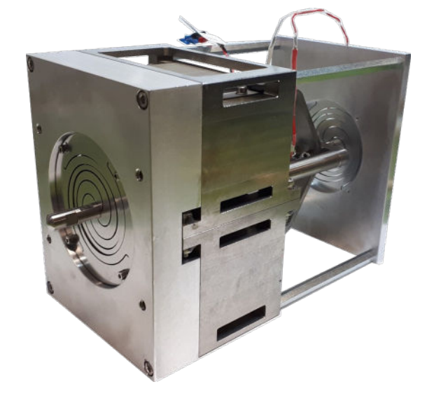
Fig. 1: Inchworm Piezo motor Demonstrator and video

Piezo solution is then proposed to reduce the number of components within the actuator, increase the system reliability and decrease manufacturing costs.