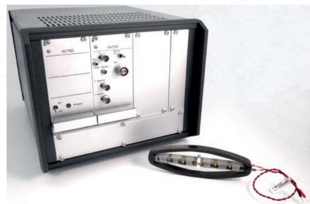
Fig2: APA® CFRP actuator driven by CTEC's SA75D high power amplifier