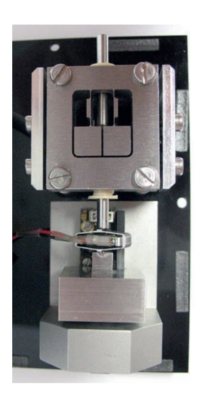
Fig. 1.b: Force and stroke test bench

Typical performances are given in the following table. This table is not exhaustive as many other actuators can be designed by CEDRAT TECHNOLOGIES using its design tools, lab facilities and technological know-how.