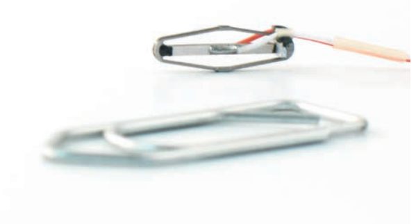
Fig. 1.a: view of the APAµXS

All standard APAs® from CEDRAT TECHNOLOGIES can be operated as a SPA with appropriate add parts. Therefore the SPA concept can be considered as a way to expand the limited stroke of the APA®. However smaller APAs® (series µXS, XXS, S,