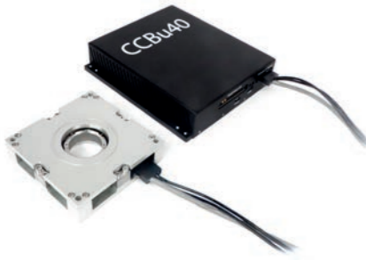
Fig. 7 : XY300M with CCBu40