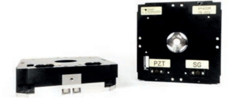
Fig. 8 : XY400M