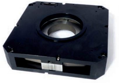
Fig. 9 : XY500M

The XY500M stage has been designed to move an infrared (IR) imager or Focal Plan Array (FPA), over 400 microns stroke along 2 axes to perform both Field Of View (FOV) scanning and stabilization of the line of sight in Airborne Electro Optic Systems (EOS). This stage is based on 4 APA400MML with SG sensor inside mounted in push pull configuration. The inner stage PCB includes robust & shielded connectors as well as a SG sensor conditioner to avoid SG feedback signal attenuation or distortion in long distance cable connection between the stage and the related controller box (CCBu40).