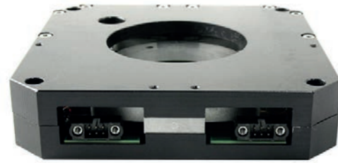
Fig. 5 : XY200M