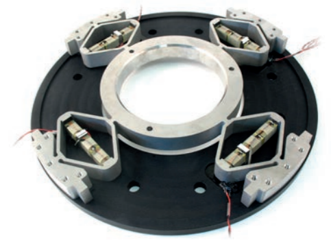
Fig. 2 : XY95ML

The XY95ML stage is based on 4 APA95ML actuators arranged by pair along each axis in push pull configuration. This stage aims at generating high frequency micro vibrations (few hundreds Hz) on a centered payload to submit it to a large spectrum of acceleration over 2 axes. This 2 axes shaker can be used either for lab testing equipment or production processes.