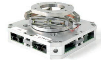
Fig. 6 : XYZ200M