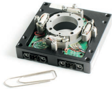
Fig. 1 : XY25XS-SG