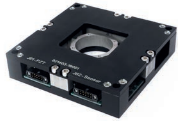
Fig. 10 : XY300M-SG-SV