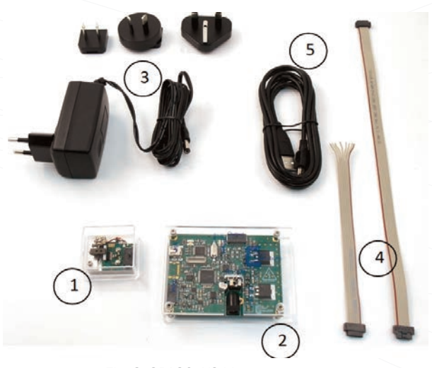
Fig. 3: SPA30µXS kit components