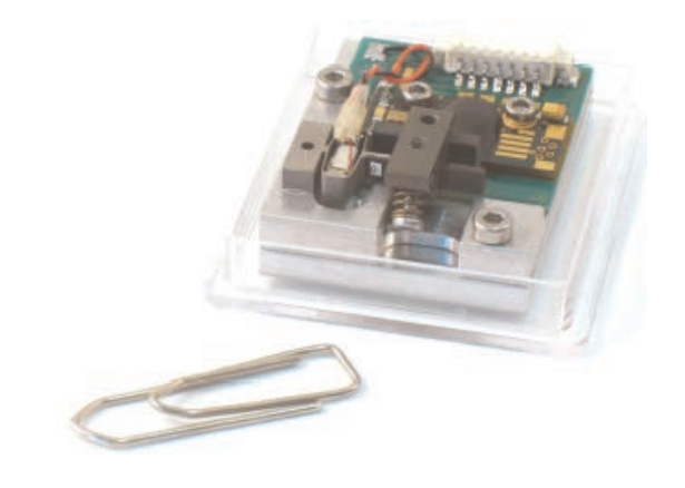
Fig. 1: SPA30µXS

The technical information on this leaflet is not contractual and can be changed without prior notice.