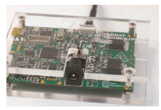
Fig. 5: Stepping Spiezo Controller SPC45