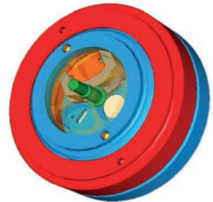
Fig. 1.b: RPA motor - CAD view