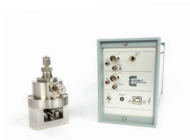
Fig. 1.b: PPV200M with CA45 electronics

One Engineering Qualification Model (EQM) has been realised and tested.