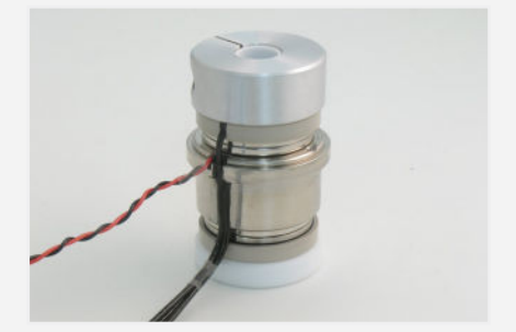
Ø Fig4: Custom 1

CEDRATTECHNOLOGIES 59 Chemin du Vieux Chêne - Inovallée 38246 Meylan Cedex - France actuator@cedrat-tec.com