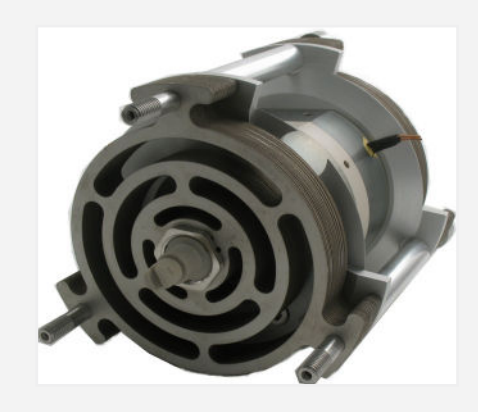
Ø Fig5: Custom 2