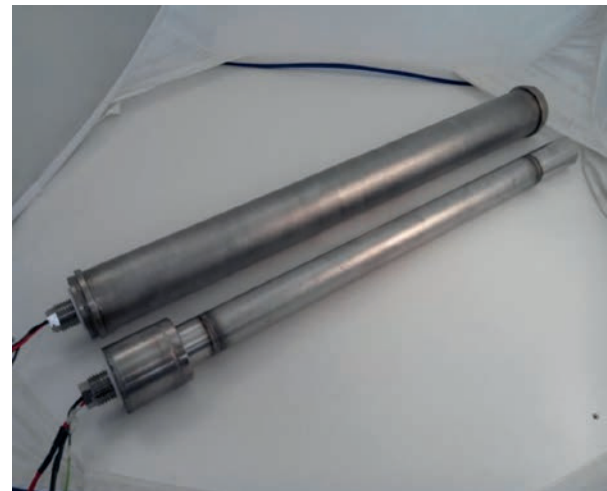
Fig. 2: Photo of both modular (MUST) [top] and conventional UST [bottom]