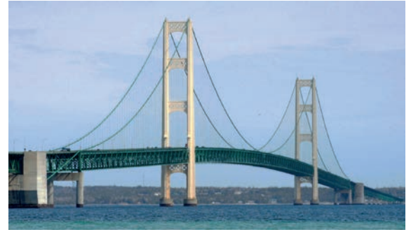
Fig. 5: A typical application of the magnetotriuctive stress sensor: monitoring stresses in bridge cables