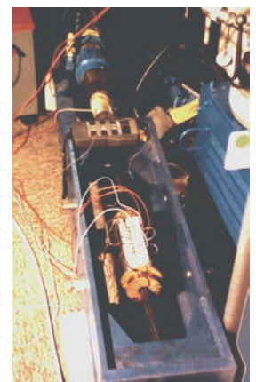
Fig. 4: Test of the sensor in laboratory.