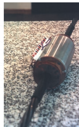
Fig. 3: Design and assembly of the sensor around of the cable.