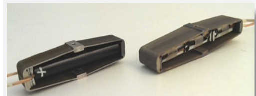
Fig3: APA400M (left) & APA600M(right)