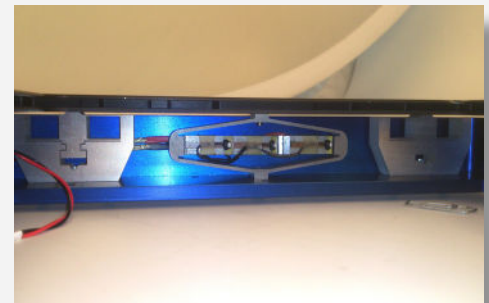
Fig2: Standard actuator from CTEC