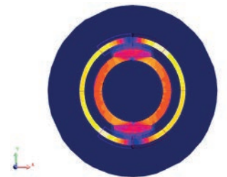
Fig. 3: Magnetic induction in the LAT 100