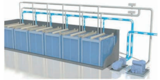
Fig. 2: Hidrowater filtration plant