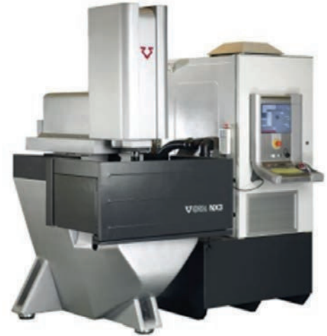
Fig. 1: ONA EDM machine

The ultrasonic devices must also be adapted. Since ultrasonic transducer are working at resonance frequency, the viscosity of