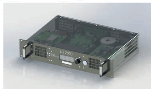
Fig. 4: CTEC's US2000 driver