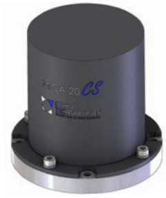
Fig. 1: View of the MICA20CS in proof-mass configuration (MICA20CS actuator + counter-mass + back position sensor)

Eu Project MC-SUITE (680478) has funded a part of this development.