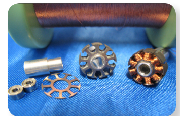
Fig.2: BLDC motor integration.