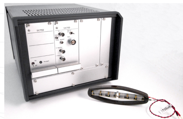
Fig2: APA® CFRP actuator driven by CTEC's SA75D high power amplifier