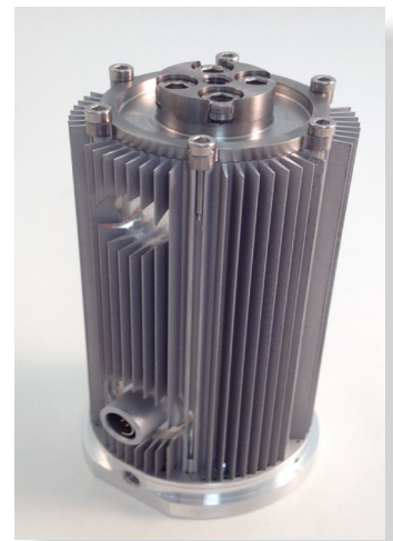
Encapsulated Pre-stressed Piezoelectric Actuator (PPA-E) Cedrat Technologies SA